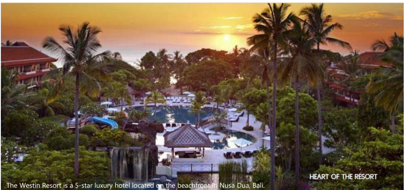
The Westin Resort is a 5-star luxury hotel located on the beachfront in Nusa Dua, Bali.