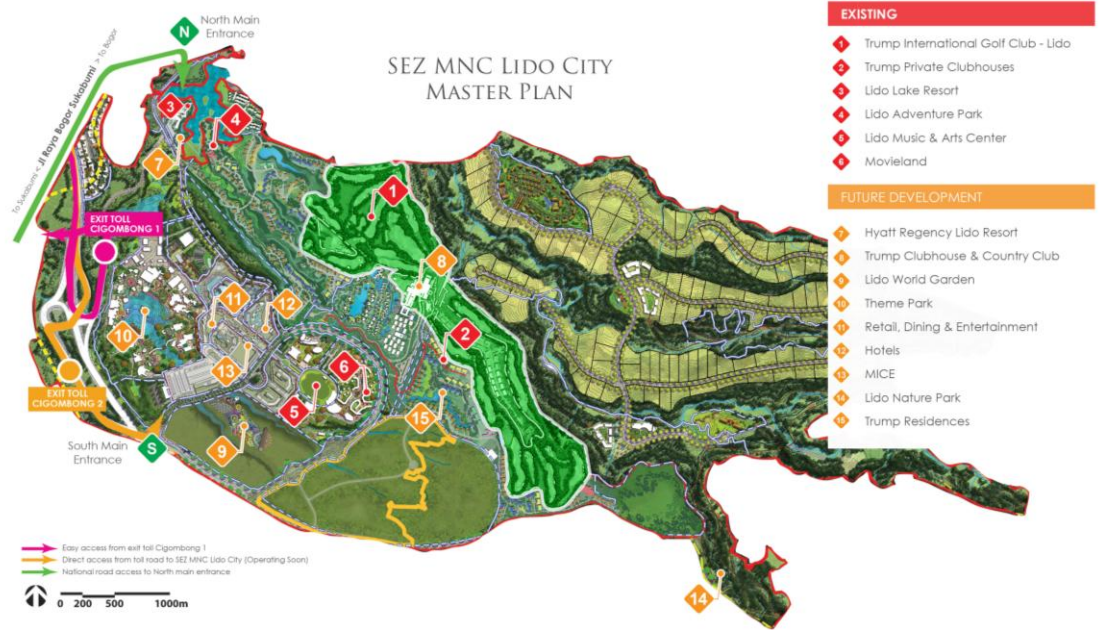
Exhibit 01. MNC Lido City SEZ Master Plan spans 1,040 Ha within a total area of 3,000 Ha in Lido, West Java