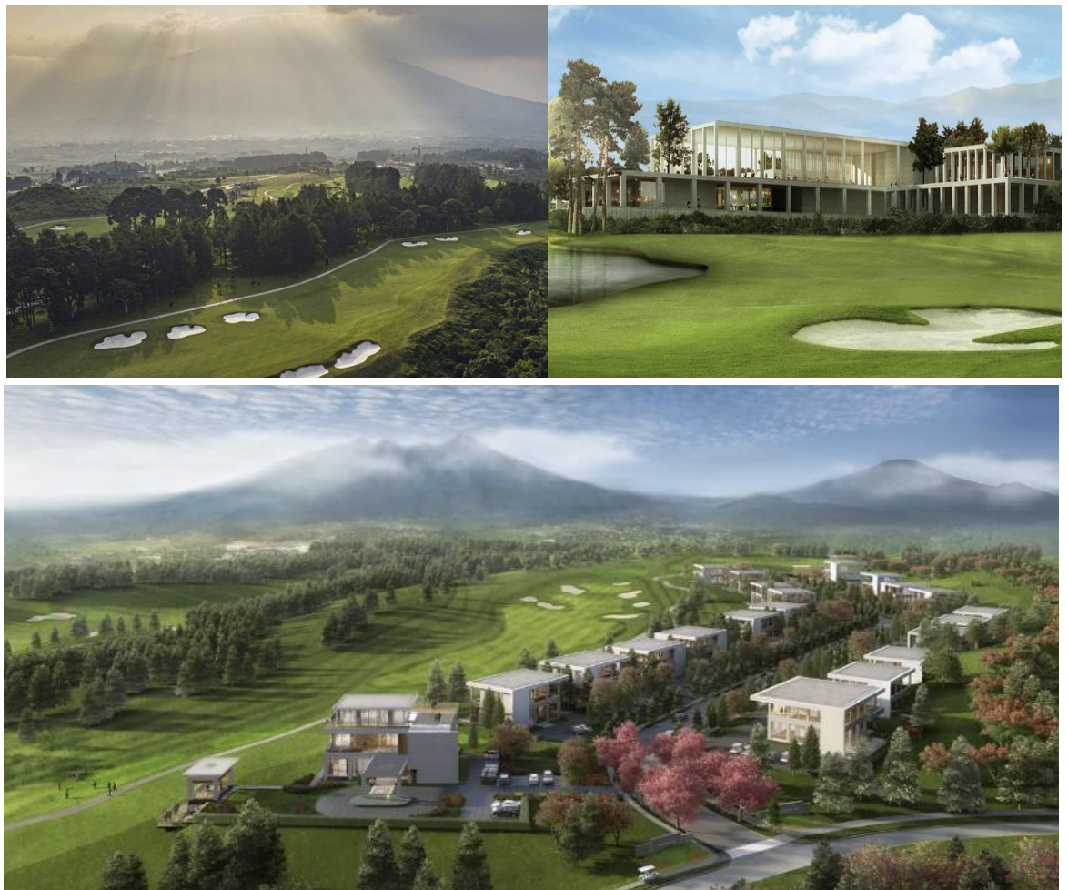
Exhibit 02. Trump International Golf Club with 21 units of exclusive Private Clubhouses