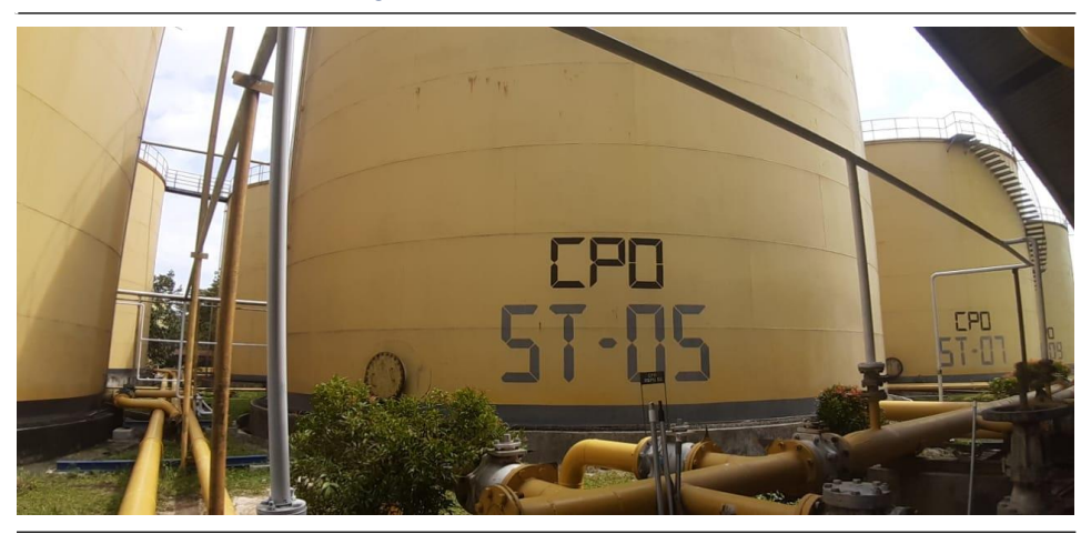
Exhibit 15. Labanan CPO storage tank

On the last day, we visited the bulking storage in Labanan, Berau, harboring 14 CPO tanks and 2 CPKO tanks totaling 44k tons. The CPO transported by the truck are immediately sample-tested at the lab. The CPO we witnessed had an FFA of 2.6%. The storage tanks maintains the CPO temperature at 50°C before discharging onto the buyer's ship.