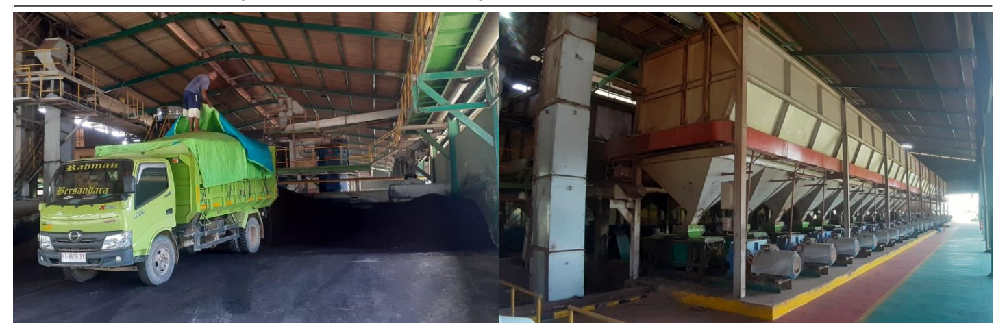
Exhibit 9. KCP: Kernel unloading-site (LHS) and the kernel pressing units (RHS)