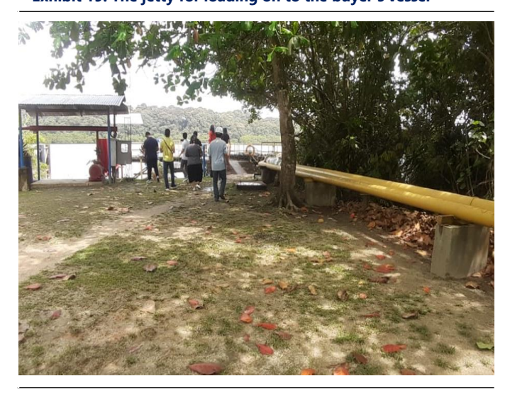
Exhibit 19. The jetty for loading on to the buyer's vessel