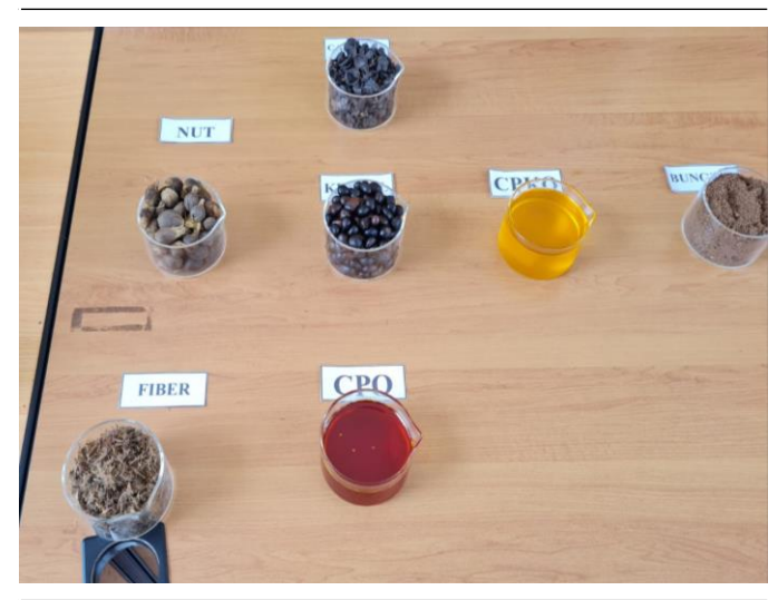
Exhibit 18. Product samples