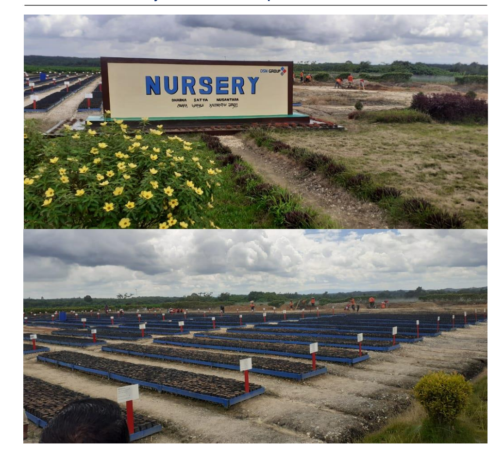
Exhibit 2. DSNG's Nursery to include a mix of top-notch breeds