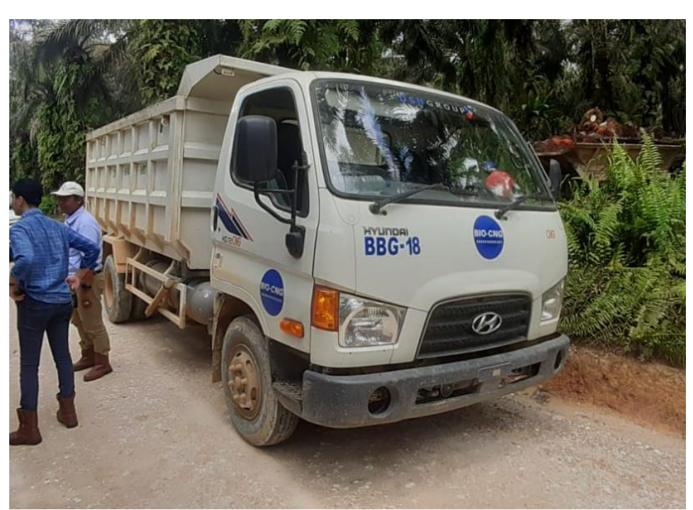
Exhibit 7. ESG practices: DSNG steadily adopts more Bio-CNG trucks into their fleet