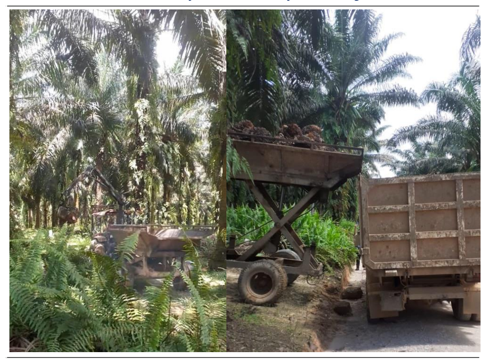
Exhibit 6. More mechanizations to yield more efficiency in harvesting

DSNG also adopts more mechanization in the harvesting process, in the form of a tractor equipped with a grabber-crane to grab the fresh fruit bunches (FFBs), which then gets stacked on the tractor's barrow before it gets passed over to the back of the transporting Bio-CNG truck.