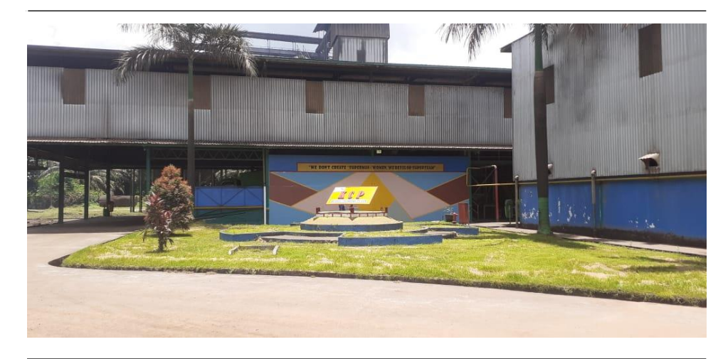
Exhibit 8. KCP

The mill contains two main production lines, consisting of 27 kernel-pressing units each.