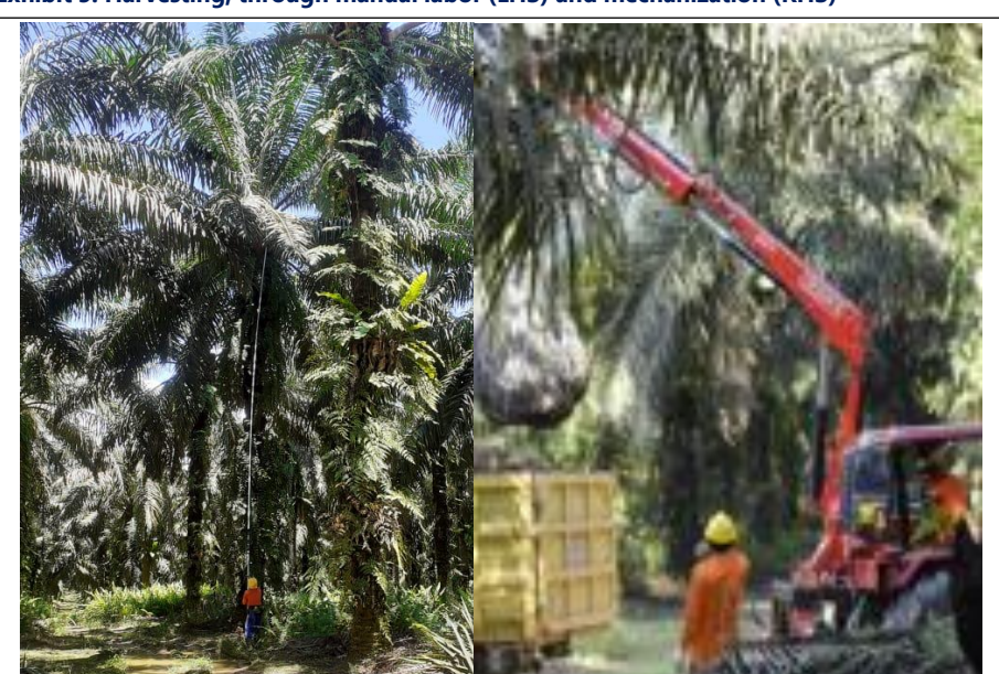
Exhibit 5. Harvesting, through manual labor (LHS) and mechanization (RHS)