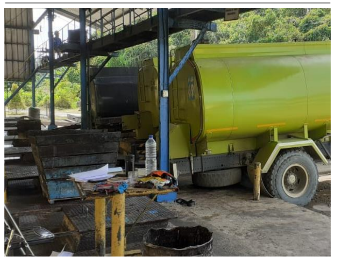
Exhibit 16. A truck discharging CPO