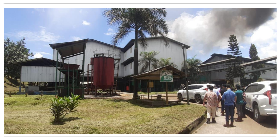
Exhibit 10. Palm Oil Mill