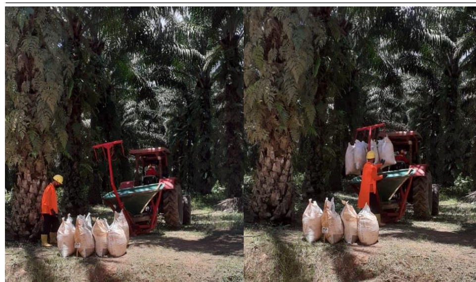
Exhibit 4. Mechanical fertilizer-spreading