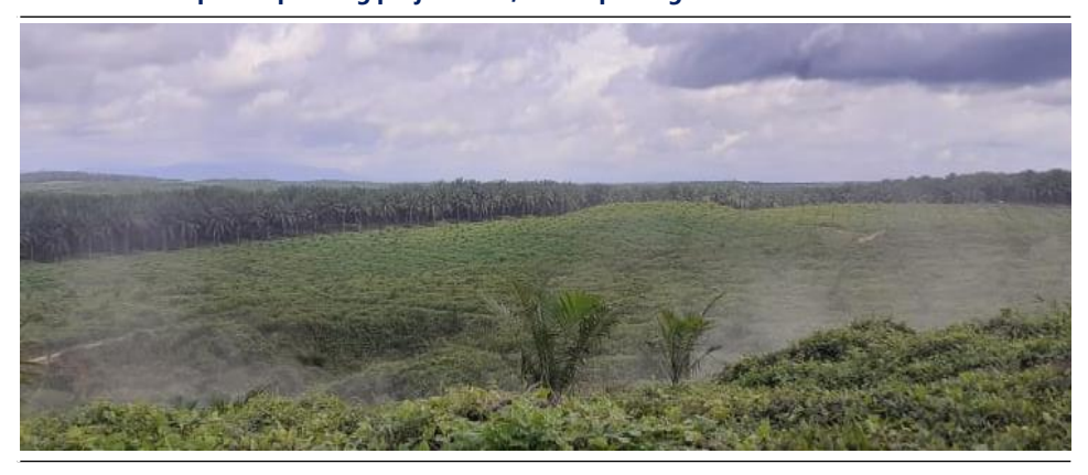
Exhibit 3. The pilot replanting project field, encompassing 383 ha